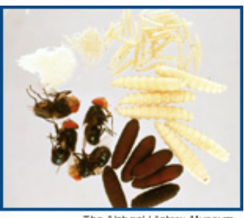
Life cycle of a typical blowfly.

Blowflies have four life stages--egg, larva (maggot), pupa and adult. The larval stage is divided into three instars and between each instar the larva sheds its cuticle (skin) to allow for growth in the next instar. The pupa is a transition stage between larva and adult. It is found inside a barrel-shaped puparium, which is actually the hardened and darkened skin of the final instar larva. The immature stages of blowflies are poorly documented in comparison to the adults.